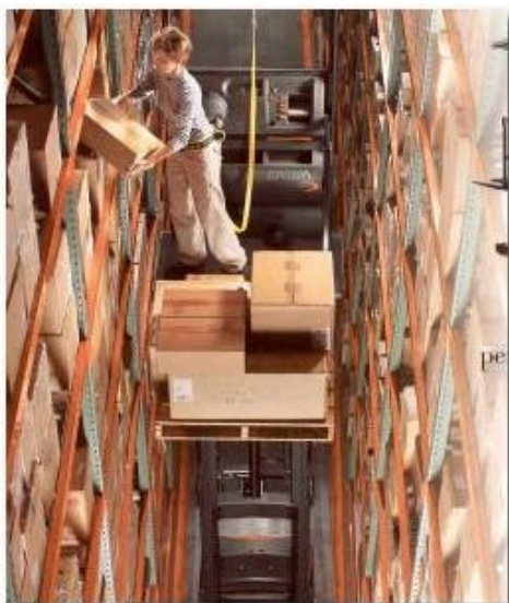
(Above) The 140,000 sq ft ware house was covered by 14 analogue CCTV cameras.